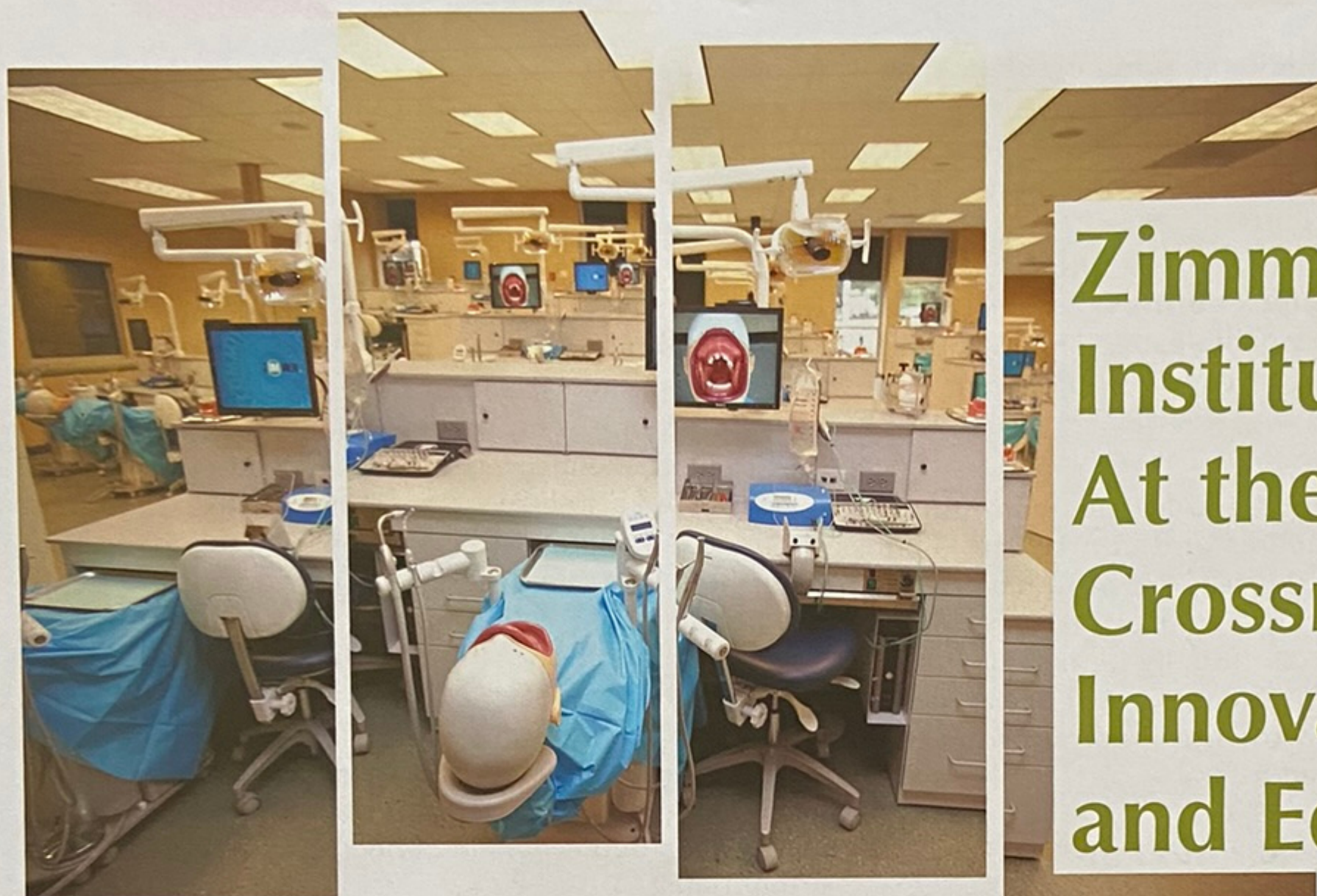
Interior of the state-of-the-art Simulated Patient Lab at Zimmer Institute in Carlsbad, CA.